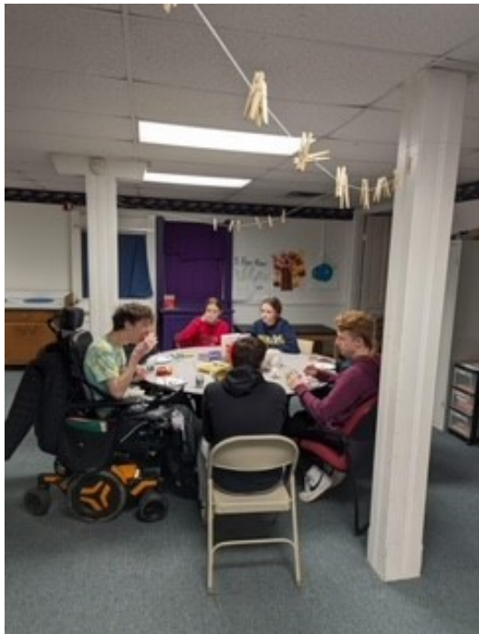
Working on their Escape Room challenge.