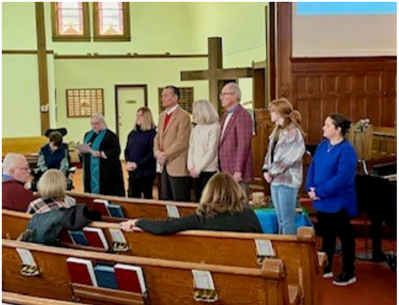
Installation of our new Session members